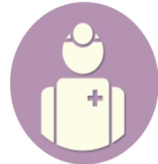
At the Doctor