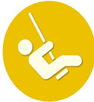
Out of School