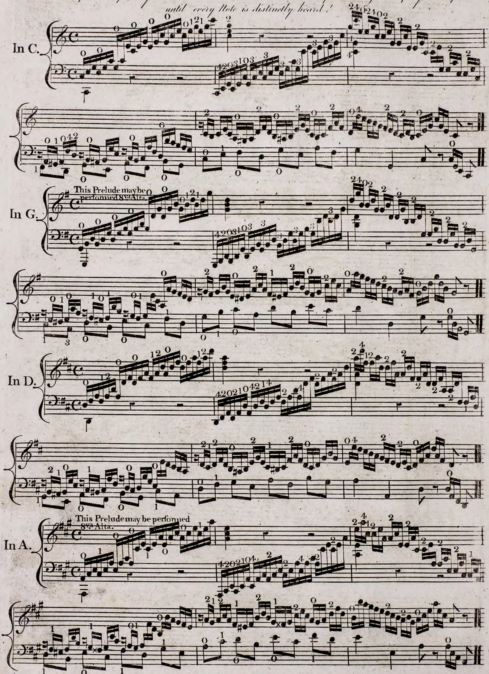
2 NB In order to attain a certain degree of perfection in performing the following Relades it is recommender to practice separately the Prette Hand then the Chass time strictly observing not to play too rapid ' until every Note is distinctly heard ! 2402-92