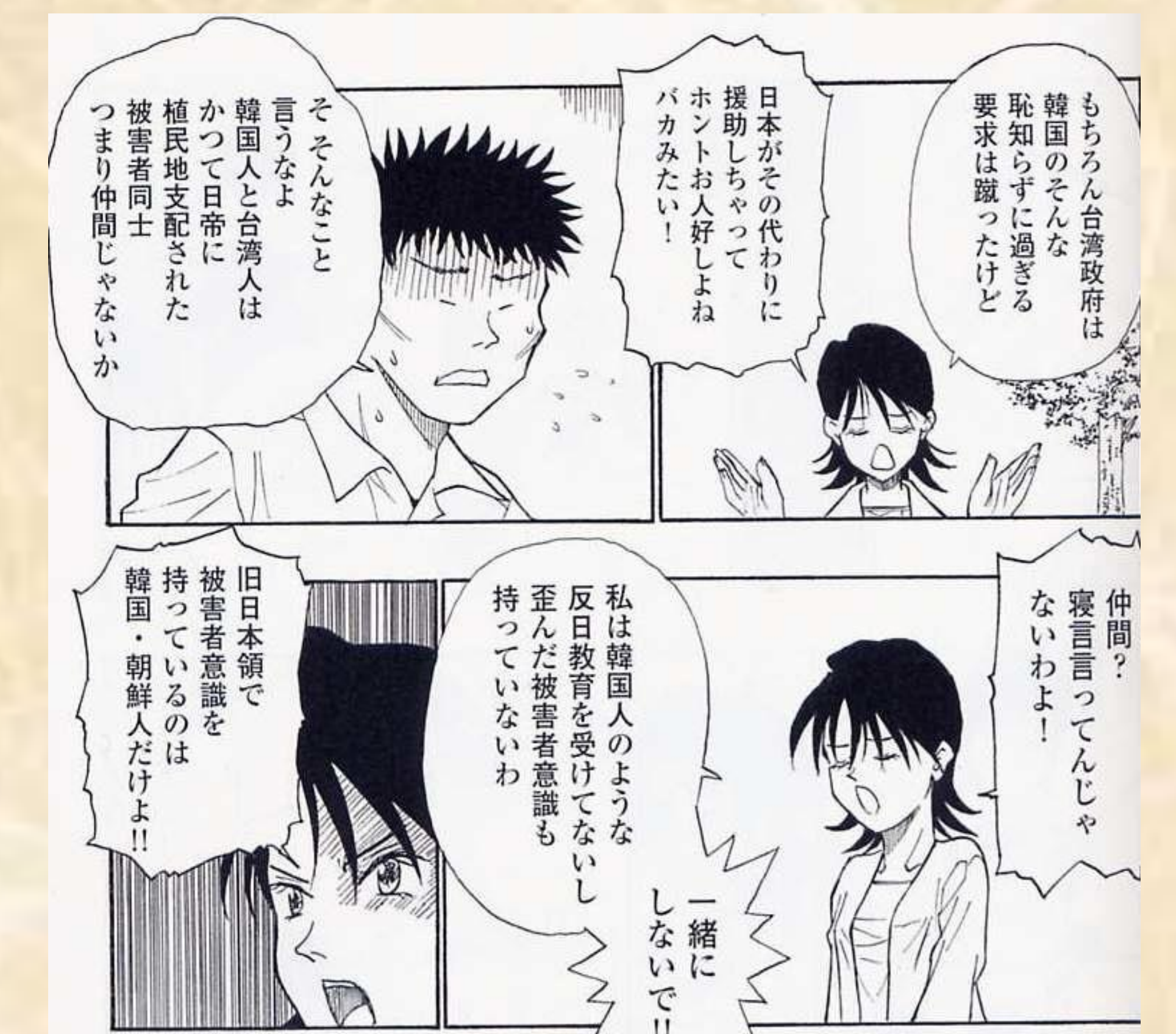
Kenkanryu : A panel portraying a Taiwanese student stating she does not share the Koreans victim consciousness