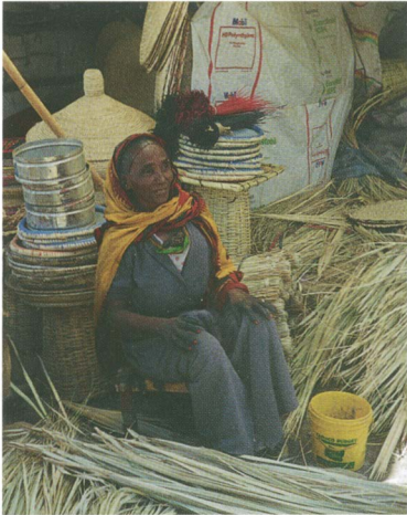
Impressions from Ethiopia: Nine months in Addis Ababa.